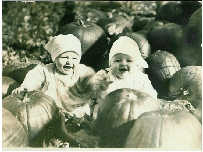
The Twins, ca 1919